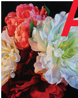
Top: Student work by Najin Bae Bottom: Student work by Mo Zhan